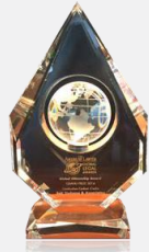
American Lawyer Global Legal Award, 2014