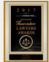
Innovative Lawyer Award From Financial Time, 2017